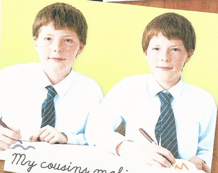
My cousins making my banner