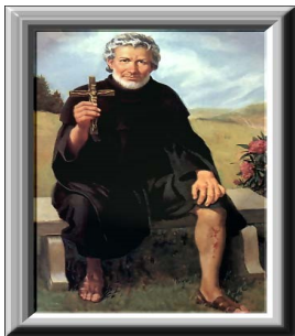
Saint Peregrine Patron Saint of Cancer Patients:

God, who gave Saint Peregrine an angel as his companion, the Mother of God as his teacher, and Jesus as the physician for his illness; grant, we ask You, that we on earth may intensely love the Blessed Virgin Mary and our Saviour, and in Heaven bless them forever. Grant that we receive the favor for which we now ask ..... through Jesus Christ Our Lord. AMEN.